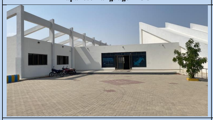
Science and Technology Park