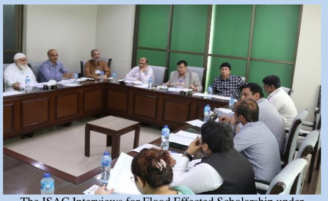
The ISAC Interviews for Flood Effected Scholarship under USAID Funded Merit and Need-Based Scholarship Program held on Monday, 22<sup>nd</sup> May 2023.