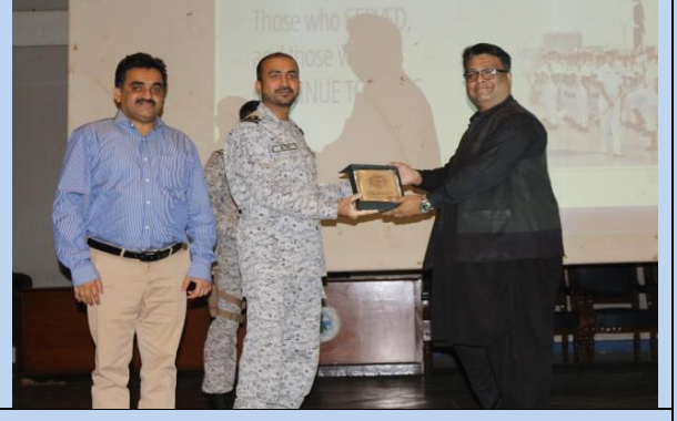
Pak Navy Recruitment drive