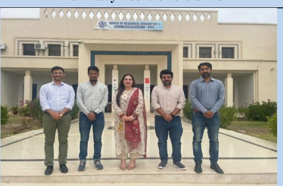
Pak Matiari transmission line Recruitment