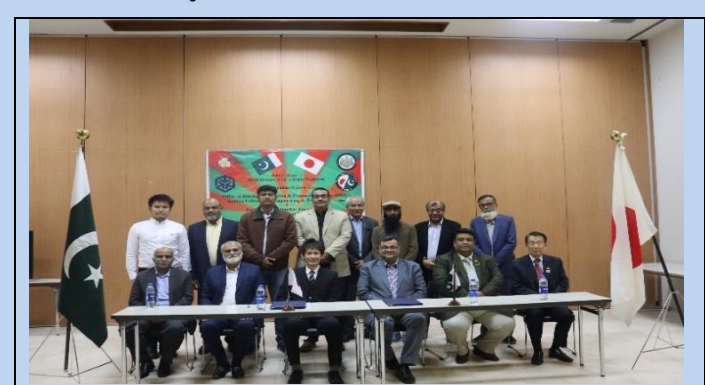
Japanese Language MOU