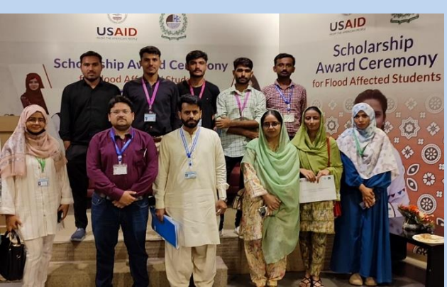
Certificate Distribution Ceremony for Flood Affected scholarship awardees organized by USAID in partnership with HEC, Pakistan at IBA, Karachi on 20th October 2023.