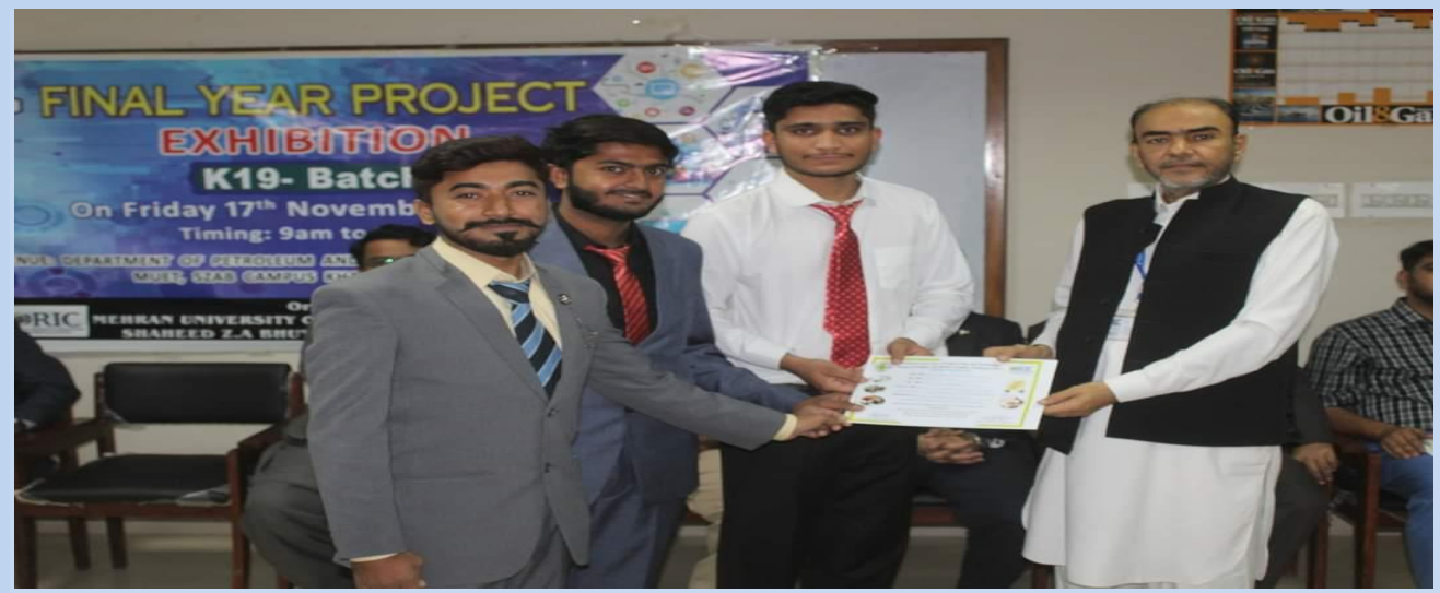
FYP Exhibition held at campus